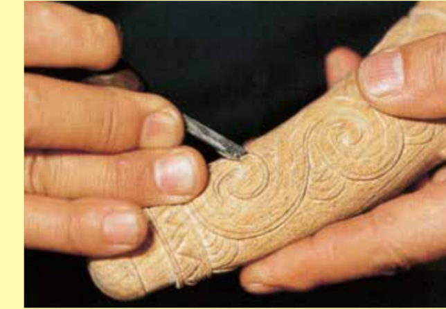
Carving a pattern

Ainu men used to create a variety of patterns on items using only a knife. Such traditional patterns can be seen on knives, trays and ritual tools. New patterns based on this tradition are still being created today, showing a broadening of Ainu culture.