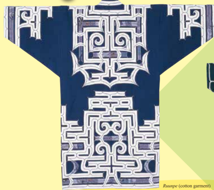
Rauupe (cotton garment)

The Ainu used to wear tree fiber, fish skin and animal skin clothes. However, when cotton became available to them as a material, they began making more decorative garments, which are still used even now for rituals and dancing.