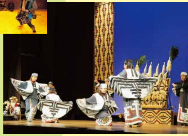
Sarovun cikap rimse (crane dance)

Traditional Ainu dancing has been protected in various parts of Hokkaido and designated as a national intangible folk cultural asset. There are a variety of dances, from ones that mimic animal movements and express daily labor to ones just for entertainment. Visitors can always see such dance performances at Akan Ainu Kotan and Poroto Kotan (Ainu Museum) in Shiraoi.