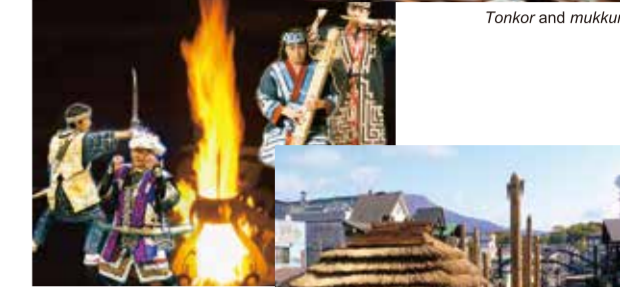
Iomante Fire Festival