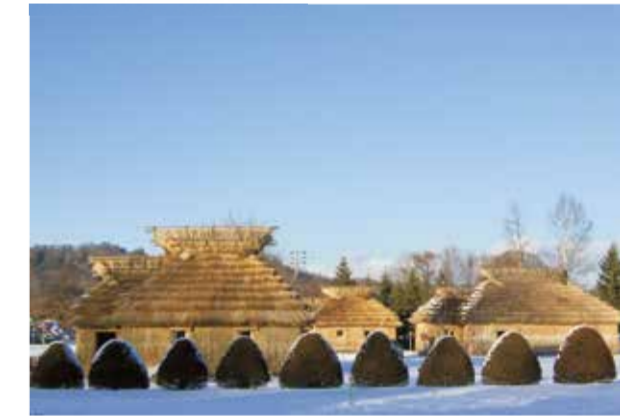
Cise - traditional Ainu houses