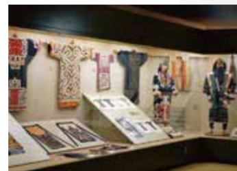
Exhibition of ethnic materials