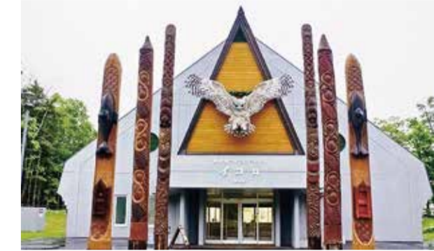
Ainu Theater "Ikor"