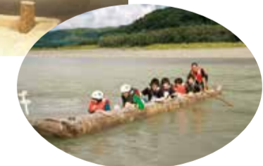
Cipsanke (boat-launching ceremony)