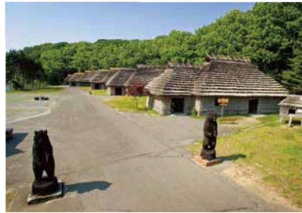
Overview of Poroto Kotan