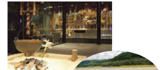
Exhibition of ethnic materials