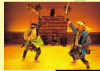
Emus rimse (sword dance)