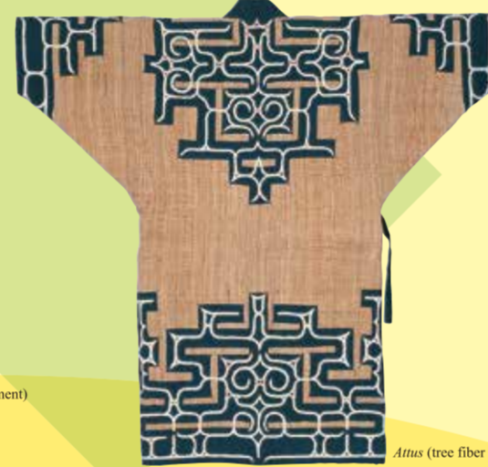
Atus (tree fiber garment)

Y Admission L Opening hours C Closed *Please contact each facility for group rates.